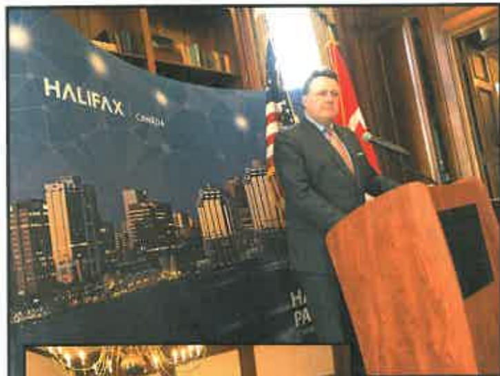
(above) Mayor Mike Savage of Halifax, Nova Scotia