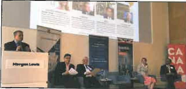
Consul General David Alward addressing the forum