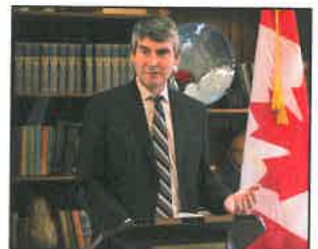
Premier Stephen McNeil of Nova Scotia

Look for further information on the NECBC web site.