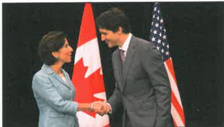
Governor Gina Raimondo of Rhode Island and Prime Minister Justin Trudeau, Providence, July 14